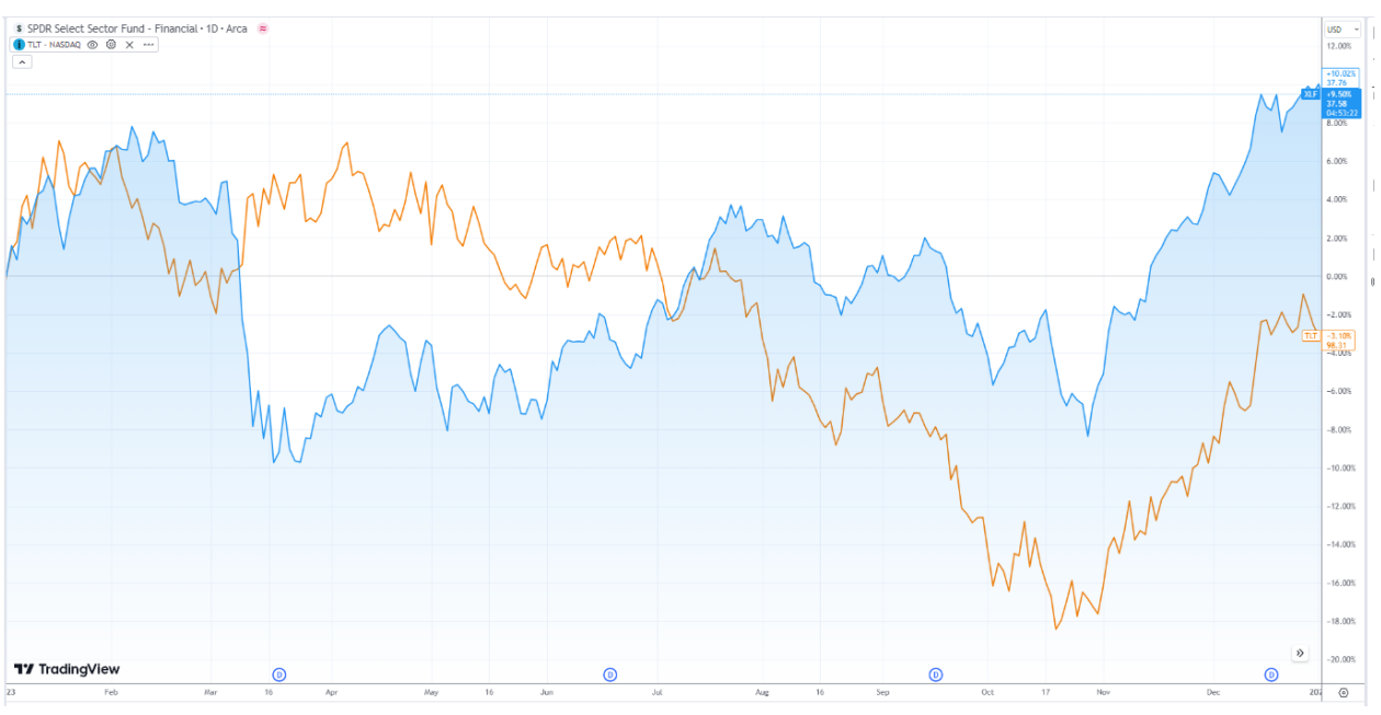
XLF (Blue) charted against the TLT (Orange)

The iShares 20+ Year Treasury Bond ETF (TLT) tracks the prices of long-dated US Treasury bonds. Because bond prices and interest rates have an inverse correlation, the TLT fell precipitously as interest rates rose in 2023. The Financial Select Sector SPDR Fund (XLF) tracks the performance of stocks in the market's financial sector. As you can see in the chart below, the charts of the TLT and the XLF tracked each other in near lockstep throughout 2023: