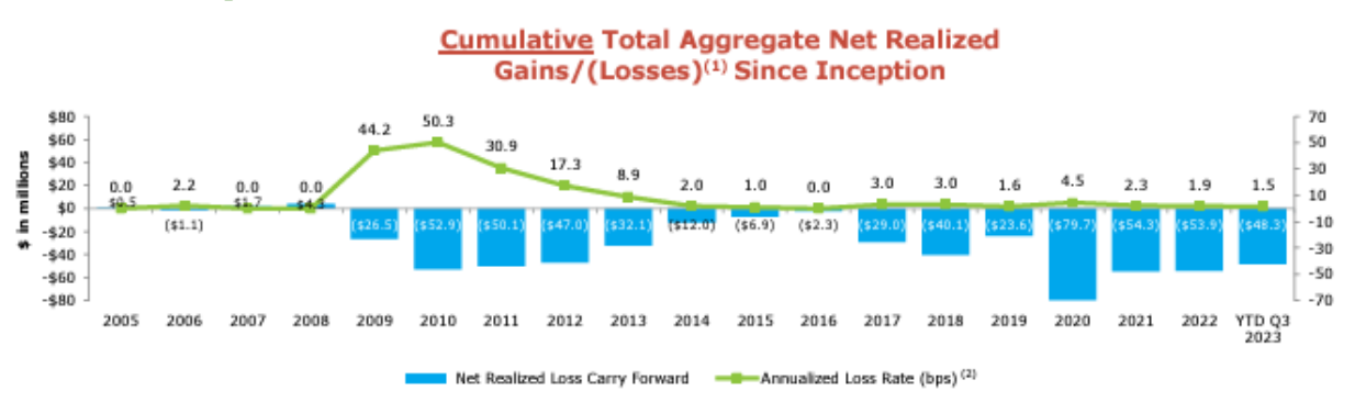
HTGC has an Annualized Loss Rate of 0.015% in 2023

Hercules is one of the largest business development companies (BDCs) in the marketplace today. We like the fact that the company does the vast majority of its lending deals using floating rate notes, which means that the business is not directly exposed to losses in rising interest rate environments. The company has a durable business model and disciplined lending process, which has served to minimize losses over time. As you can see in the below chart from the latest <u>investor presentation</u>: